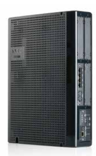
SL2100 Communication Server: Scalable from 5 to 100+ users